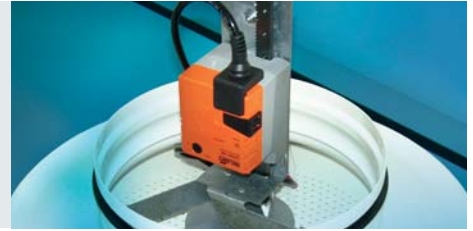
Ceiling air outlet